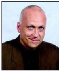
Cal Ripken Jr.

Cal Ripken played 21 seasons with the Baltimore Orioles. His Hall-of-Fame career includes being one of only eight players to have 400 home runs and 3,000 hits. In 1995 he broke Lou Gehrig's record for consecutive games played, and he voluntarily ended the streak in 1998 after playing 2,632 consecutive games.